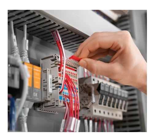
The new Klippon® Connect Portfolio from Weidmüller is supported through an intelligent Configurator.

An important element in their customer support is providing intelligent configuration tools that guide the user through all of products on offer, helping